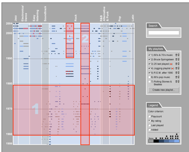
Figure 2. Visualizing music libraries by using rectangles.

This visualization is similar to the disc visualization but using rectangles instead of discs. In the disc visualization, the time axis was represented along the radius of the disc, and in the rectangle visualization the time axis goes along the vertical axis. Similarly, for this visualization, the attribute genre goes along the horizontal axis. The result of this visualization is shown in Figure 2.